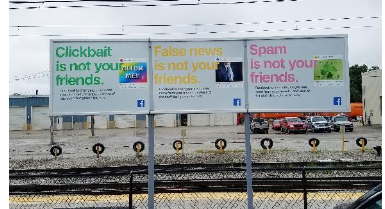
Platform - 2 Sheet Billboards