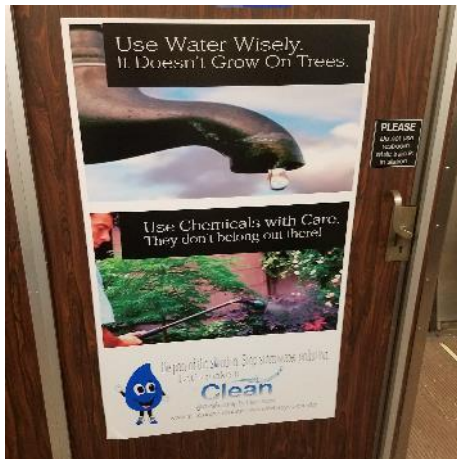
Entry Wall Door/Aisle